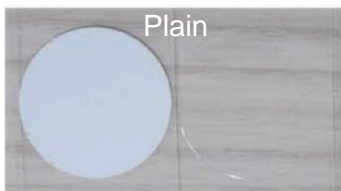
Standard MCE Opticlear MCE

Our strict Quality Control enables to eliminate fibrous foreign substances thoroughly which could be white-out via microscopy. This enables you to count captured asbestos easier.